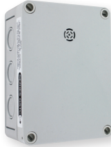
Wall Mount Without LCD