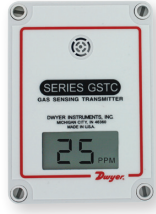
Wall Mount With LCD

High Accuracy Electrochemical Sensor, Universal Output or BACnet & Modbus® Communication Protocol Options