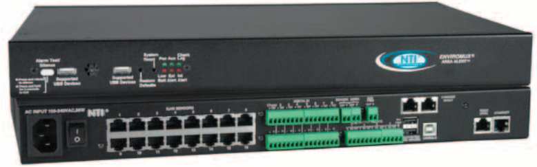
ENVIROMUX-16D (Front & Back)