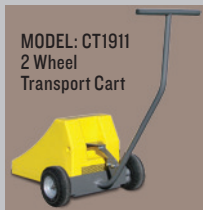
MODEL: CT1911 2 Wheel Transport Cart