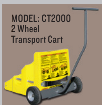
MODEL: CT2000 2 Wheel Transport Cart